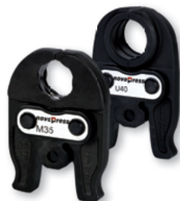
Press jaws PB15